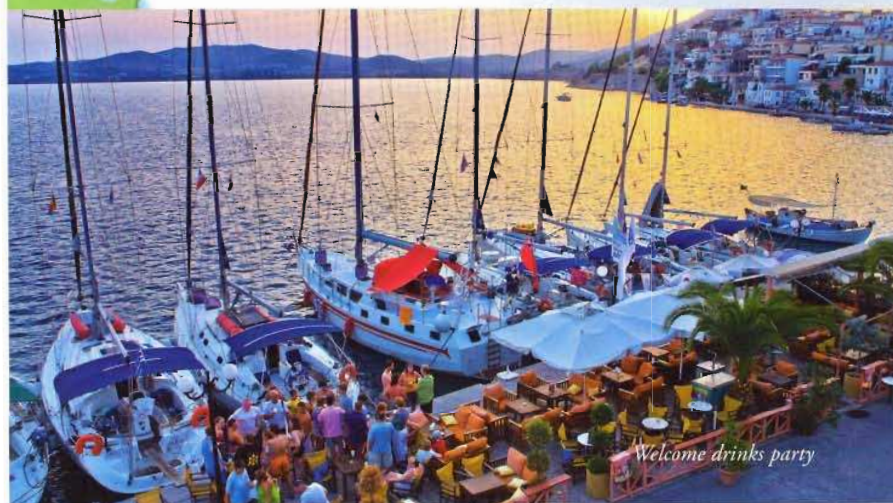
Welcome drinks party